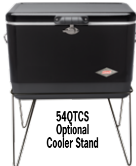
54QTCS Optional Cooler Stand