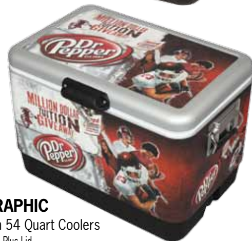
FULL GRAPHIC WRAP on 54 Quart Coolers Imprint: 4 Sides Plus Lid